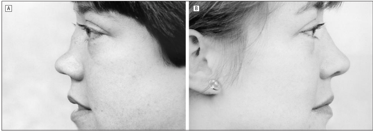
Figure 1. Preoperative (A) and postoperative (B) views of a patient who underwent primary rhinoplasty with a 10-mm Gore-Tex graft for severe saddle-nose deformity.