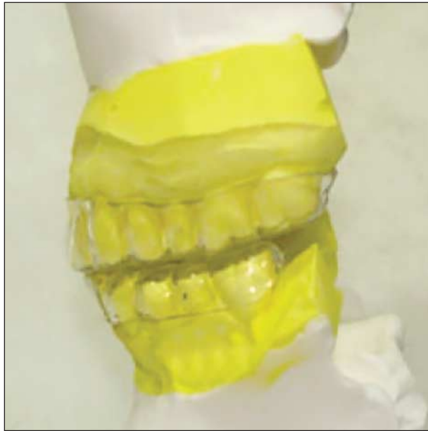
Figure 1. A photograph of the mandibular advancement device used in this study. It is custom-made from a monobloc and individually fitted without an open bite.

severe OSA, CPAP treatment is considered the standard treatment modality.